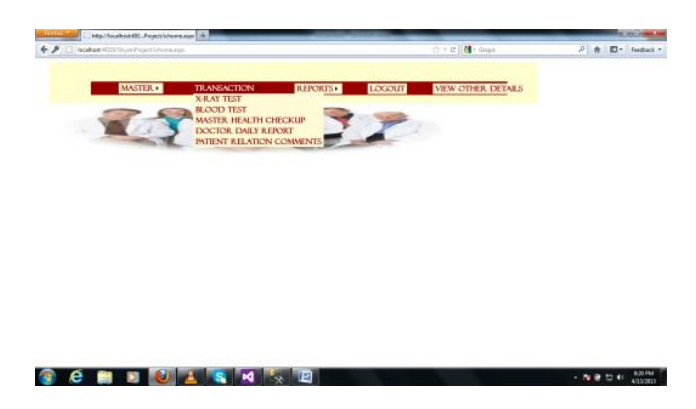
Figure 3: Transaction

Here the regular updating of the test reports and the patient status will be maintained in this section. The sub modules are x-ray test, blood test, master health check up, doctor's comments and the patient relative's comments. This section will give brief idea about the patient status like allergic medicines, prescription details, in case the patient is admitted into other hospital they will be easily identified the patient status in the transaction section details.