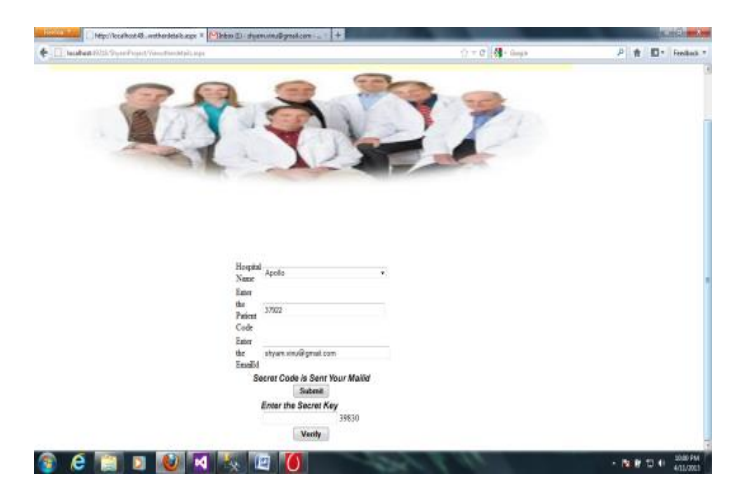
Figure 4: Encrypted Report